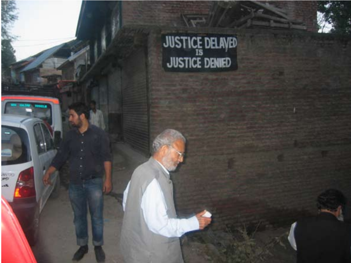
CRPF camp overlooking the Rambiara nallah where bodies were found and murder site